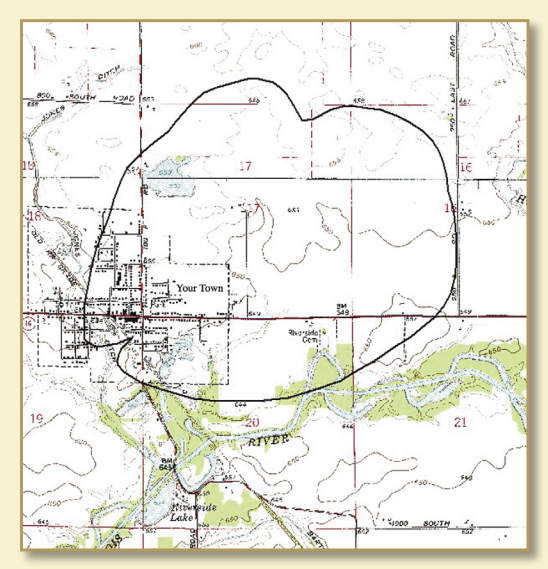
An example of a wellhead protection area, representing the five-year time of travel of ground water to the well.